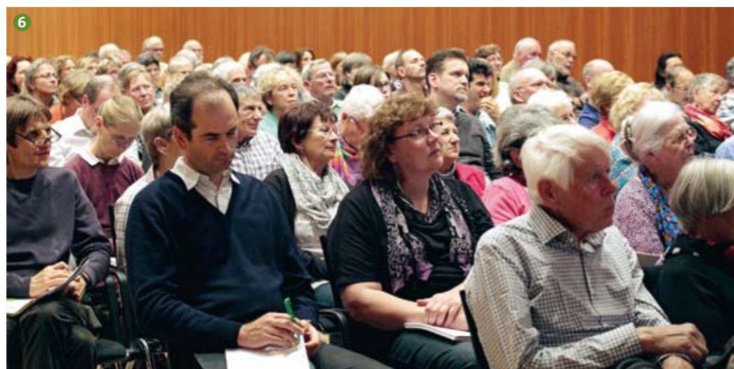
Listeners in rapt attention at Dr. Tanaka's first presentation in Singen, which was also attended by many members of the Swiss EM Association.

For the maintenance of good health and for prevention purposes the manufacturer recommends 10-30 ml per day. Dr. Tanaka was asked this several times. He gave the non-binding recommendation to take up to 30 ml of EM-X Gold daily for prevention purposes, and to increase the daily dosage to 60 ml if one is ill or under heavy strain, and up to 150-500 ml daily in the case of serious illness. Needless to say, this should always be discussed with and, as necessary, overseen by a doctor or healing practitioner.