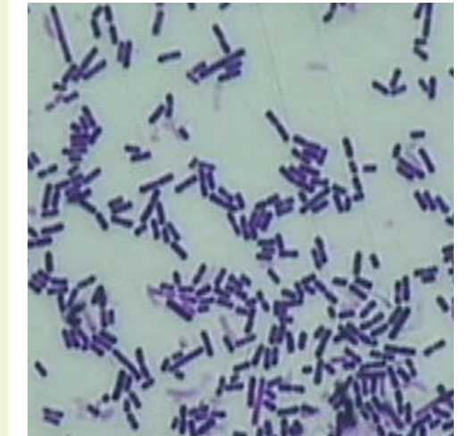
Lactic acid bacteria ferment organic matter and produce organic acids that inhibit pathogens.